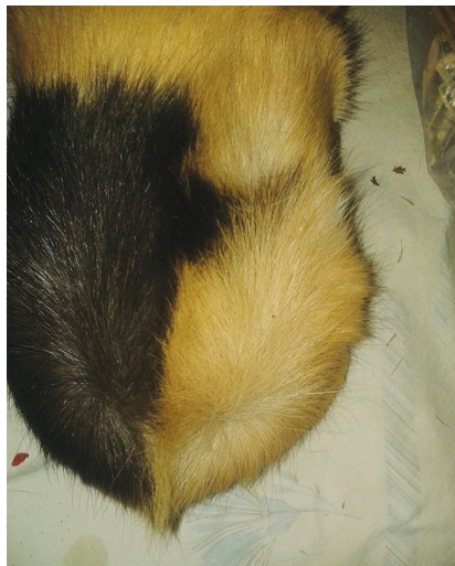
Figure 5. Guinea pig after a one-month-therapy