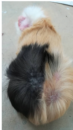
Figure 1. The patient at admission