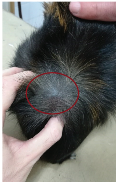
Figure 6. The mass on the dorsal rump

However, in one guinea pig, we did not succeed in using medication therapy to achieve the desired effect. Five months after the therapy and re-growth of hair on the dorsal rump, a mass the size of 3 times 5 centimetres appeared (Figure 6). A solitary cutaneous nodule on the dorsum of the animal was clinically examined and aspiration by fine needle biopsy was performed. Cytological examination revealed cohesive groups of anucleate, mature, squamous epithelial cells with clear evidence of keratinization. Based on the localization and cytological features of the lesion, it was supposed that the most probable diagnosis is trichofolliculoma.