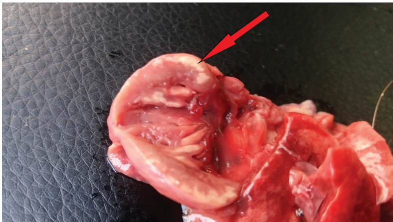
Figure 3. Multifocal cardiomyocyte mineralization

One of the guinea pigs was in a very bad condition and died just after radiological examination. Gross examination did not reveal any skin lesions. Random, multifocal to coalescing, well-demarcated, irregular, pale areas in the myocardium were observed at necropsy (Figure 3). Mild to moderate multifocal mineralization was also evident in the kidney and lung tissue. There was no sign of mineralization in the liver. Histopathological findings included severe, extensive multifocal cardiomyocyte mineralization with degeneration and necrosis, and fibrous tissue proliferation. These lesions were consistent with metastatic mineralization (Figure 4).