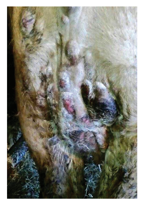
Figure 1. Cutaneous nodules disseminated on the skin of the perineum

Clinical examination revealed numerous nodules of varied size, from a few millimeters to approximately 10 centimeters, disseminated predominantly on the skin of the udder and the perineum, some of which were coalescing and exulcerated and partially alopecic (Fig 1).